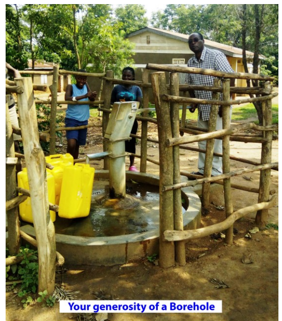
Your generosity of a Borehole